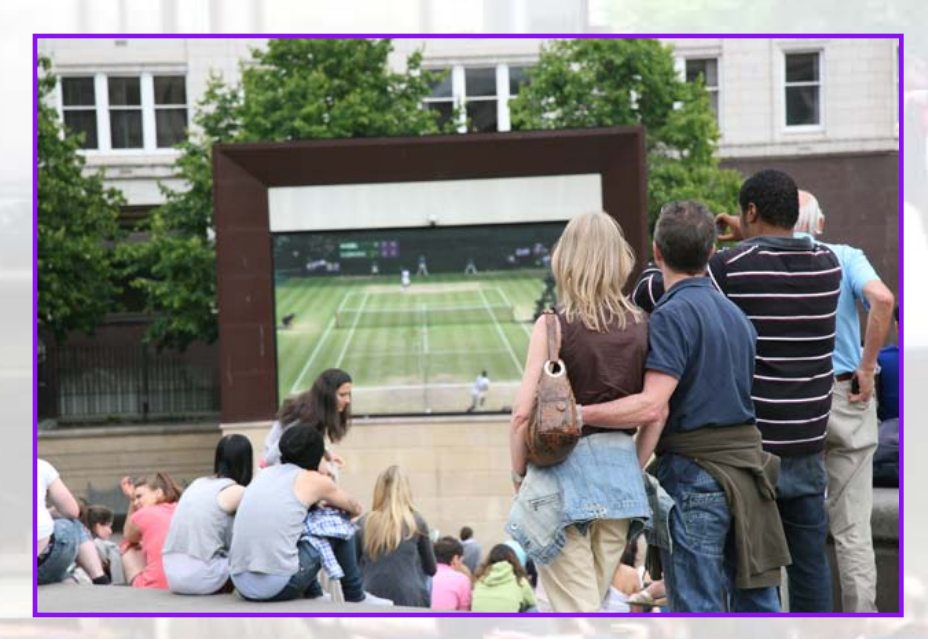
Wimbledon coverage - Birmingham