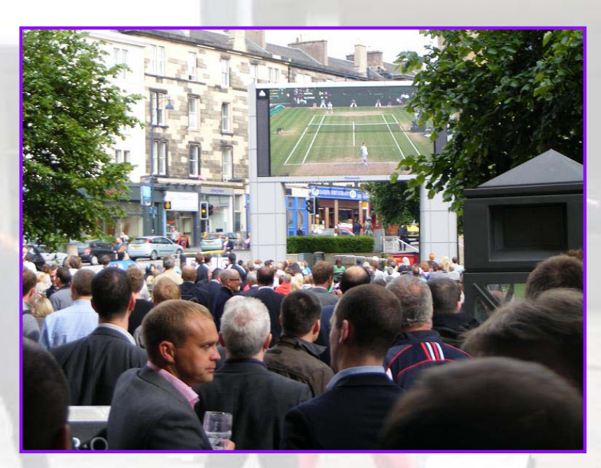
Wimbledon coverage - Edinburgh