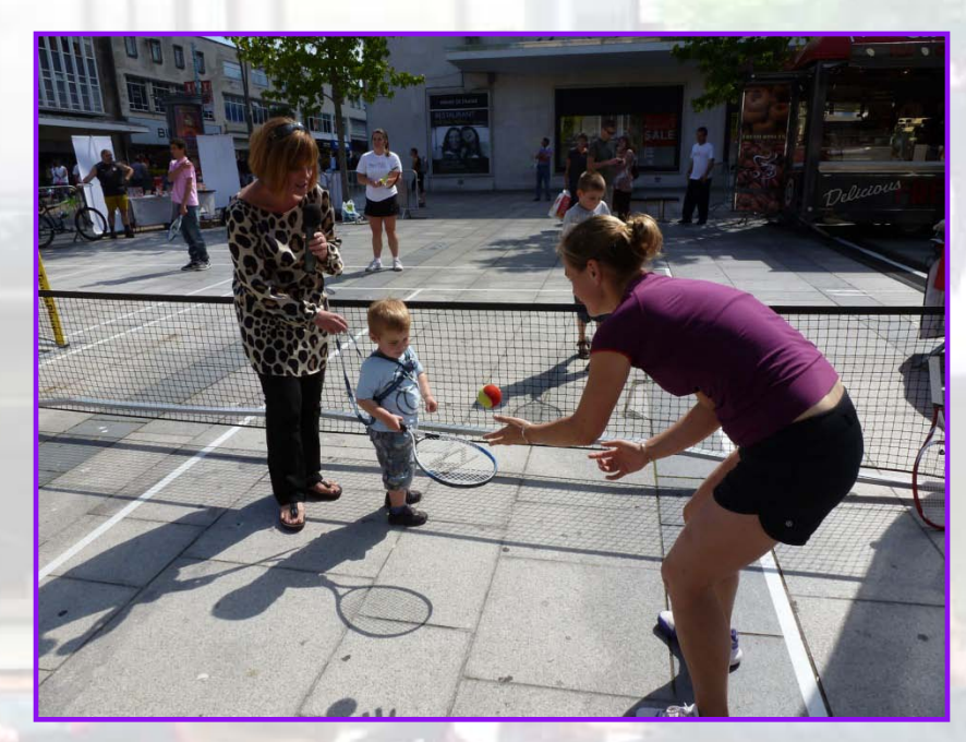
Wimbledon activity - Plymouth