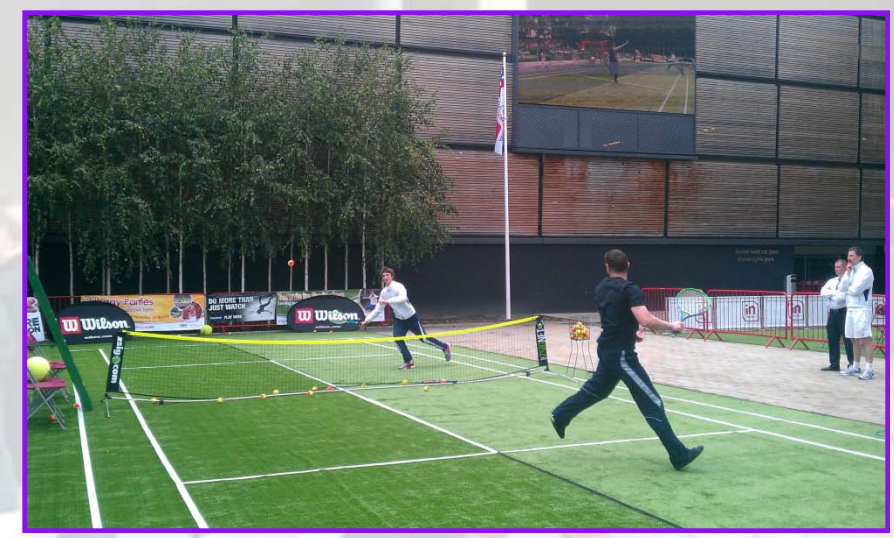
Wimbledon activity - Swindon