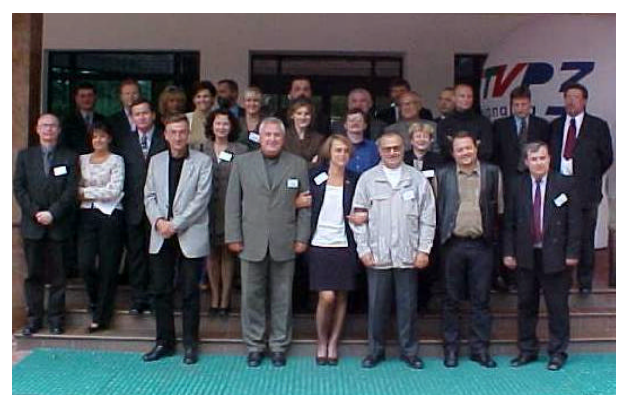
The participants of the international meeting in Czarna, Poland, September 10-11